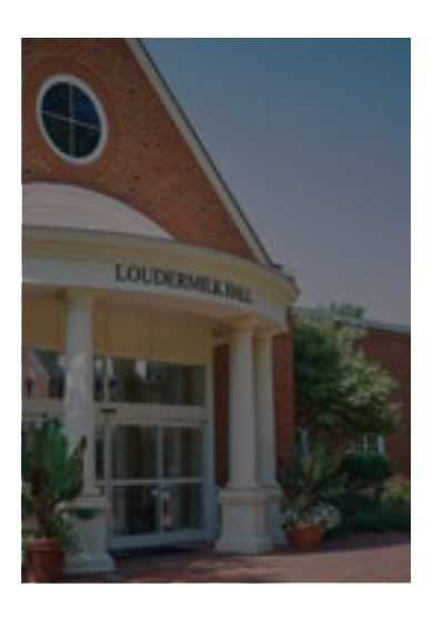
Loudermilk Hall features three tiered amphitheaters, 21 breakout rooms and a dedicated, flat-floored multi-purpose space that allows for easy partitioning.