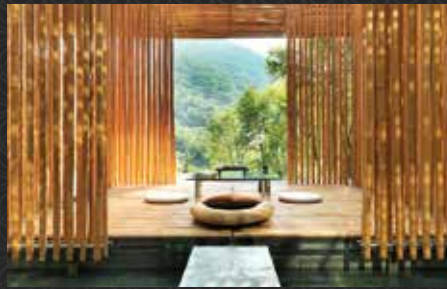
COMMUNE BY THE GREAT WALL