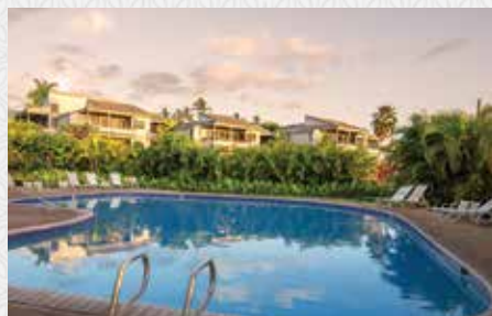
WAILEA EKOLU VILLAGE