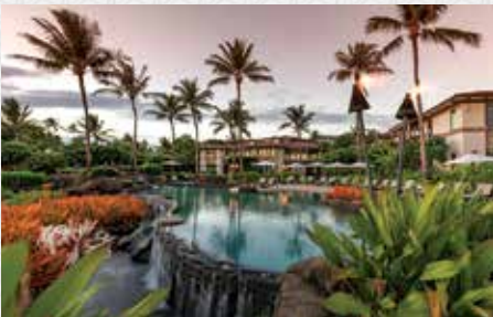
WAILEA BEACH VILLAS

YEARS OF RESIDENTIAL EXPERIENCE IN HAWAII