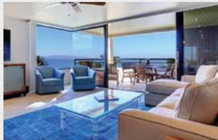
POLO BEACH CLUB MAKENA