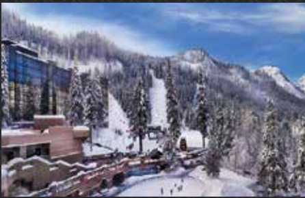
RESORT AT PALLISADES TAHOE