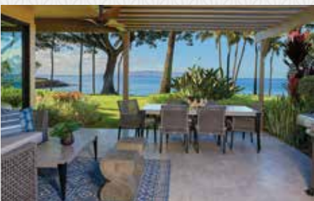
WAILEA ELUA VILLAGE