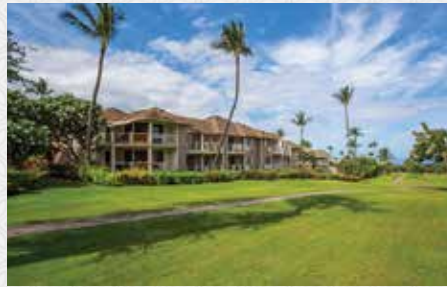
GRAND CHAMPIONS VILLAS