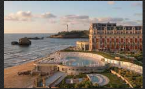
HOTEL DU PALAIS

We invite you to contact Brandon Sacks to learn how Destination Residences Wailea can unlock your property's performance potential.