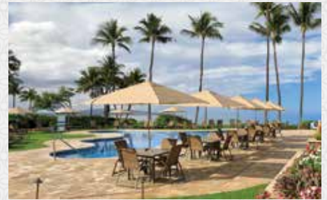
WAILEA EKAHI VILLAGE