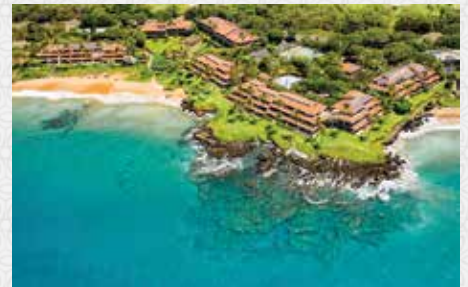
CLUB MAKENA SURF