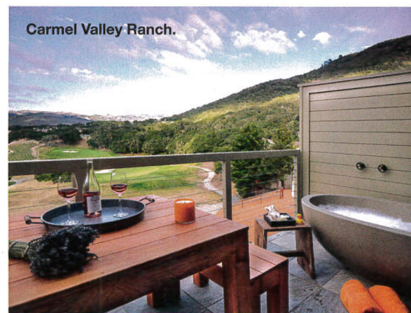
Carmel Valley Ranch.

On the grassy banks of the Khwai River in the fecund Okavango Delta of Botswana sits this safari camp of 14 ultra-luxurious tented rooms, a master suite, an indoor/outdoor dining and common area and fantastic open-air spa. Guest accommodations are elevated for the best vantage points of the savannah and its myriad wild animals. Book into the honeymoon-perfect suite and you'll enjoy an expansive deck complete with private plunge pool, romantic hammock and telescope in a decidedly secluded setting. Also on deck are an outdoor shower and a stunning copper-framed Victorian bath, from which you can marvel at the brilliant African sunsets (room rates start at $4,060 per person, per night and are all inclusive; belmond.com).