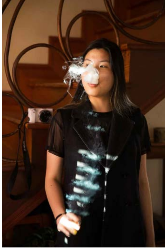
AMBER POINTS, COURTESY OF SCOUT | LUX POT SHOP