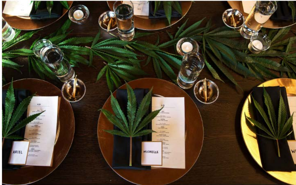
AMBER FRUITS

Since the legalization of cannabis in 2015, entertaining in Washington State has rapidly evolved to include cannabis inspired events. Due to prohibition of public consumption, people have found unique ways to partake of cannabis legally. Private, in-home parties lightly skirt the law so guests can use their favorite cannabis products.