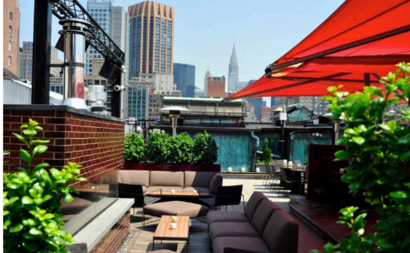
The Fireside Lounge at Roof at Park South