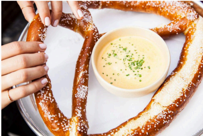
Jumbo soft pretzel with beer cheese for dipping

The menu was designed to “express fall flavors in unexpected, yet approachable ways,” noted Nancy Cushman, co-owner and founder of Cushman Concepts, which leads operations at Roof at Park South. Cushman added, “We always love a good riff on a classic,” and detailed the old-school way the bar’s White Russian is made: “We use a very old technique called milk clarification to smooth the flavors of the drink and make it crystal clear.”