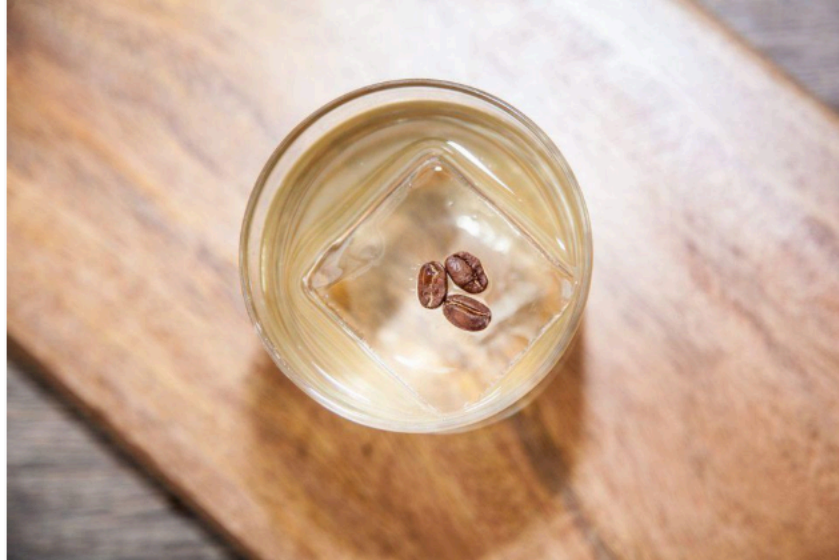
Clarified White Russian