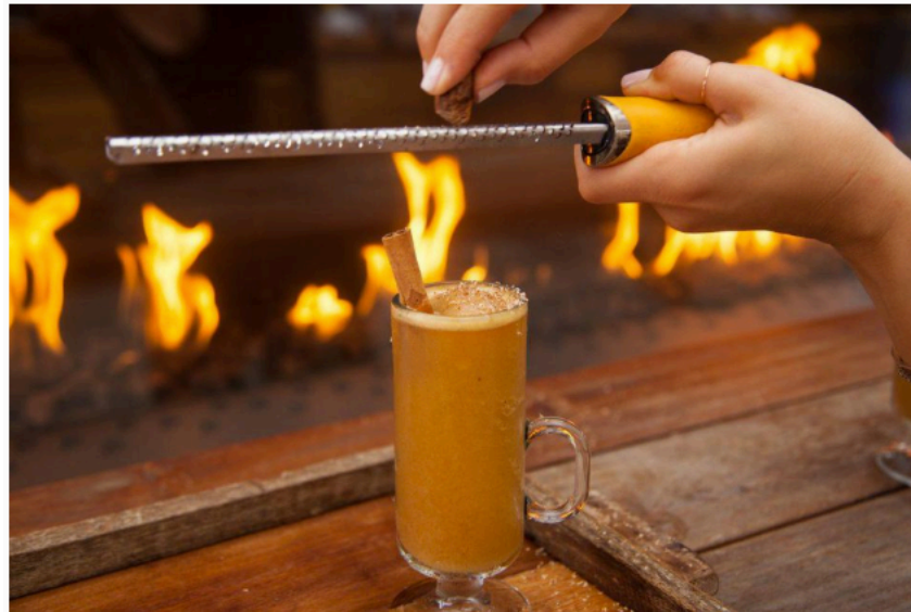
Frozen apple cider cocktail

Located atop the Park South Hotel in NoMad, Roof at Park South has embraced the season by introducing a special fall menu for the first time since it opened in 2014, with additions in both its food and drink offerings.