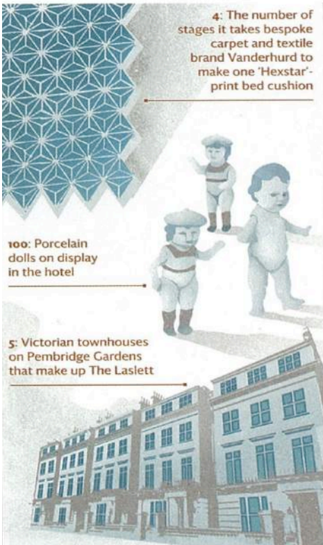
4: The number of stages it takes bespoke carpet and textile brand Vanderhurd to make one 'Hexstar'-print bed cushion

From a Turkish paradise with pool, pontoon and private beach to a storied sporting affair in Chicago, this month's best new hotel openings