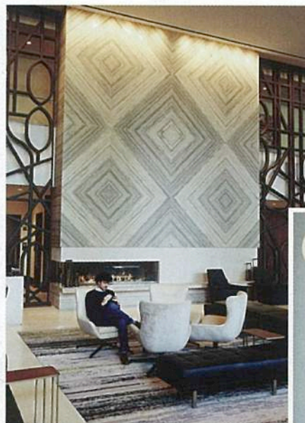
FROM TOP: Patterned travertine in the Loews lobby; coffee in bed at the Virgin hotel; the cozy first floor of the Freehand.

The Chicago classic on the Magnificent Mile has unveiled a thorough makeover inspired